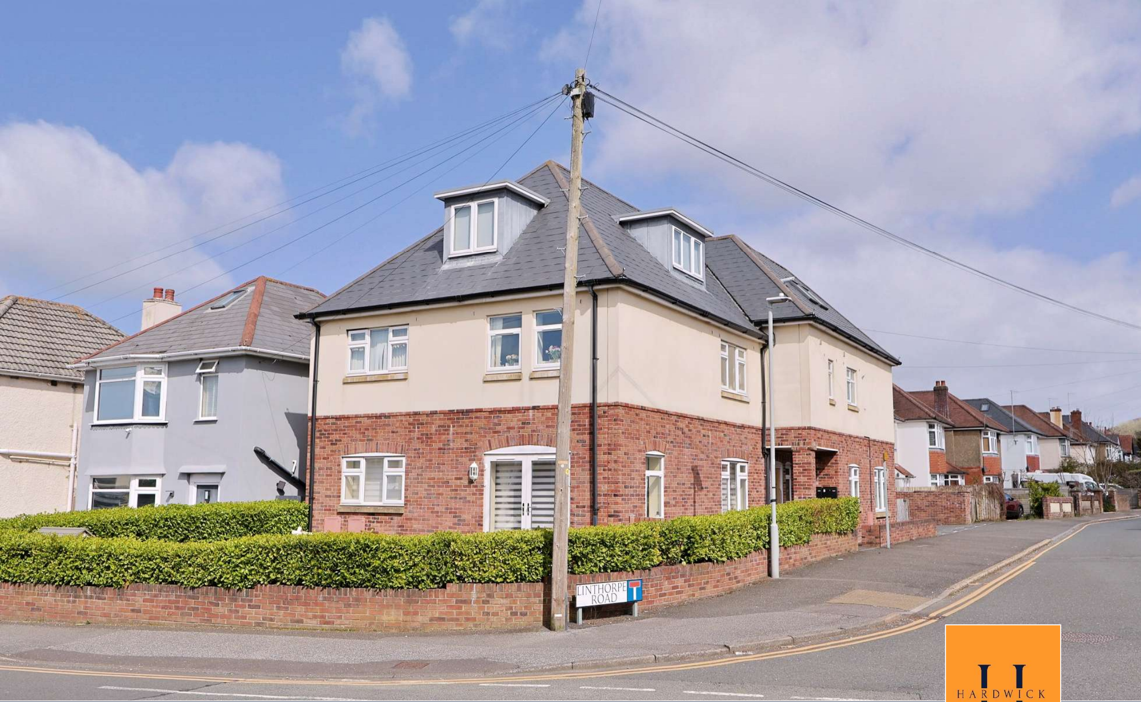
Flat 4, Linthorpe House, Linthorpe Road, Poole, BH15 2JU